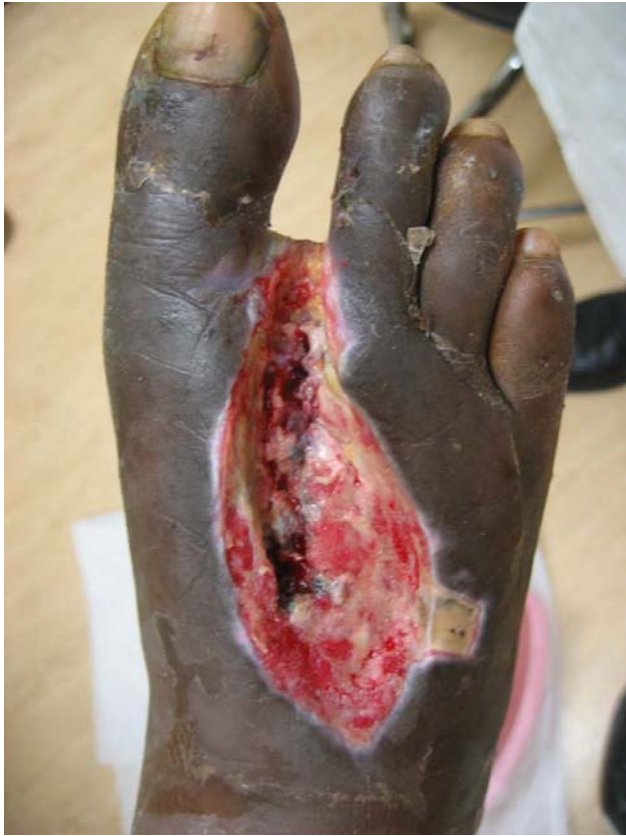
Figure 2 Case #2 represents a large, chronic post-amputation defect.

In order to promote final closure, the DermaClose™ tissue expanding device was applied. Preparation of the wound consists of surgical debridement of all non-viable tissue. The wound edges are undermined about 2cm from the wound edge. (Fig. 3) During the tension phase, the patient remained in a CAM boot and underwent daily dressing changes. Final closure of the defect was accomplished within just a few days of application. (Fig. 4,5)