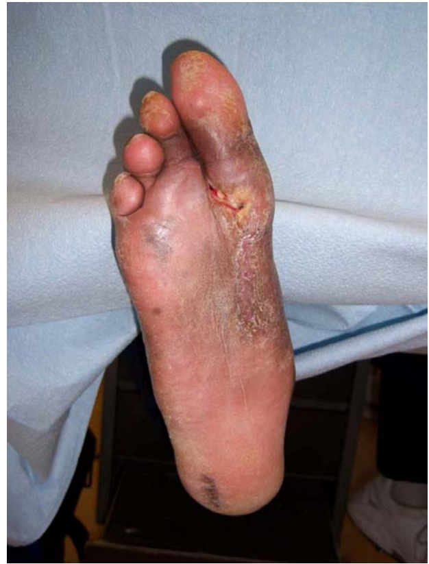
Figure 5 Plantar view of the closed wound. A separate DermaClose™ device was applied plantarily.

The DermaClose™ tension controller is attached around each skin anchor and the knob of the tension device is rotated until a clutch mechanism provides an audible indication that full tension has been achieved. The device now maintains the proper amount of tension to gently stretch the skin on the subcutaneous planes around the wound until the edges of the wound are brought close enough together for final suturing and closure.