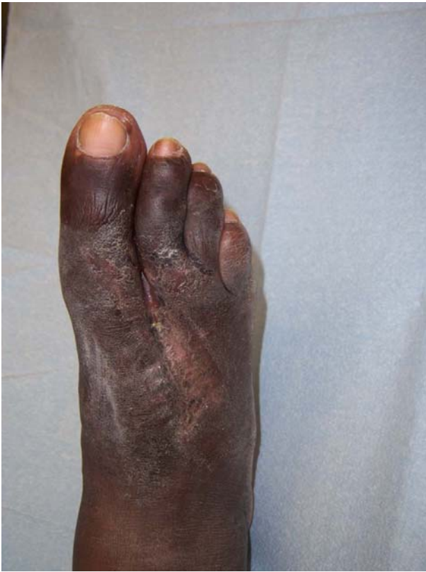
Figure 4 Closure of the chronic wound using the DermaClose™ device.

Patients should be seen every 3-5 days for evaluation of the device and the tissue movement. Care should be noted that the anchors do not envelop or imprint into the skin.