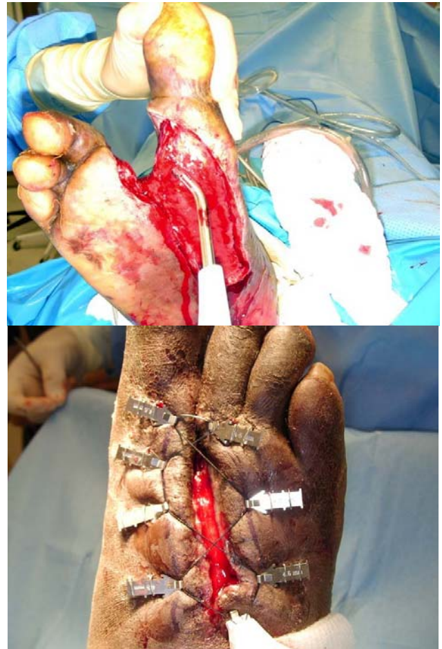
Figure 3 The wound must be surgically debrided of all non-viable tissue prior to application of the device. The device is applied and within 3 days the dorsal defect closed. Here, the anchors are tensioned in a shoe-lace fashion.

The device describe, (DermaClose™, Wound Care Technologies, Chanhassen, MN, USA) consist of skin anchors made of 316L surgical stainless steel and placed circumferential to the wound 1-1.5 cm from the wound edge.