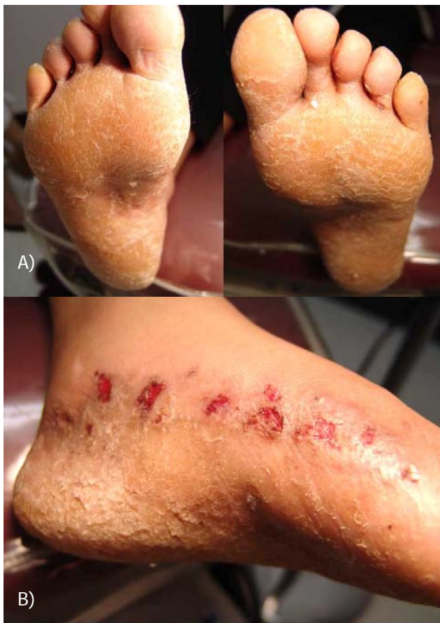
Figure 3 A 39 year-old female with diffuse keratosis to both feet (A). Secondary infectious tinea is also observed along the medial border of the foot (B). In this variant form, the hyperkeratosis is more diffuse rather than punctate along the soles of the feet.

Case 2: A 37 year-old female presents with severe plantar keratoderma and secondary inflammation and interdigital bacterial infection. She has allergies to iodine and seafood. The patient has diffuse plantar foot keratosis with nail involvement. (Fig. 3) However, her hands appeared to be almost spared of the condition. There is some distal darkening just under the distal region of the finger nail. (Fig. 4).