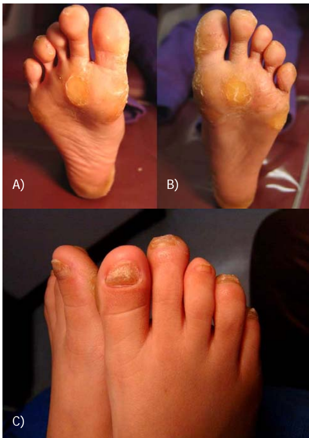
Figure 1 A 9 year old-female with severe plantar regions of hyperkeratosis (A and B). The toe nails are severely dystrophic (C). This condition began in infancy and is congenital.

In fact, pseudoainhum is characteristic in a number of hereditary hyperkeratosis. 1,2,3,4 Papillon-Lefèvre syndrome (PLS), also known as Mal de Meleda, was first described by two French physicians in 1924. 3,8,9 It is an extremely rare genodermatosis inherited as an autosomal recessive trait, affecting children between the ages of 1-4. 3 Psoriatic-like plaques involving the palms, soles and elbows are described that worsen in winter and are often hyperhidrotic resulting in a foul odor. 3 Pachyonychia congenita (PC) is a rare genodermatosis that affects the nails of all the toes and fingers. 4 Other names and synonyms of this condition are called congenital dyskeratosis and pachyonychia ichthyosiformis.