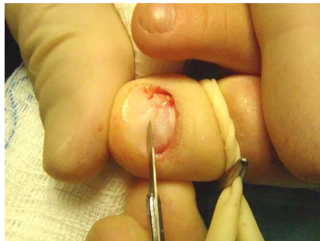
Figure 4 A number 15 blade is used to debride the superficial dense fascia from any viral inclusions.

There are reports of up to 25 % failure rates with treatment of simple warts and 50% failure rates with mosaic warts. 9 When symptomatic pain is a major complaint, surgical excision of the lesion is recommended. Careful attention to the level of excision is recommended in order to prevent scarring and decrease recurrence. Concerning pathology specimens submitted for laboratory analysis, Dr. Harvey Lamont, Director of the Laboratory of Podiatric Pathology in Philadelphia, PA. reported that “clinicians often remove warts either too superficially or too deeply to the level of the subcutaneous fat.