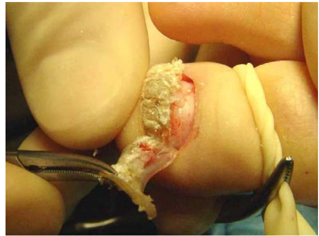
Figure 2 The nail plate is carefully removed from the nail matrix by blunt dissection. Fortunately, the papilloma did not invade the nail matrix.

The patient underwent a local hallux block under intravenous sedation. A penrose drain tourniquet was applied for hemostasis. Under blunt dissection using a small hemostat, the nail was avulsed taking care not to injure the nail matrix. (Fig. 2)