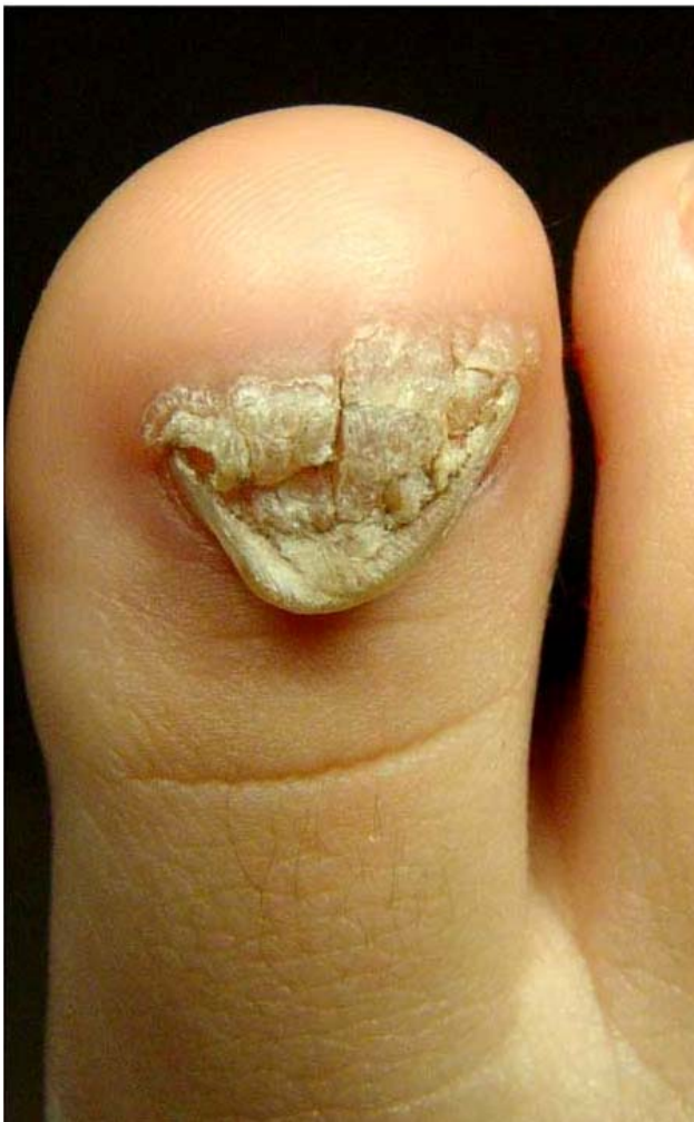
Figure 1 Initial presentation of subungual benign squamous papilloma of the right hallux.

Only recently did the growth become symptomatic. She cuts the nail back as the lesion grows. No previous treatment was initiated. Clinically, there is complete deformation of the nail plate. Fortunately, the matrix does not appear involved and the lesion appears to be growing along the distal one-third of the nail bed. It was decided the patient should undergo excision biopsy and removal of the lesion.