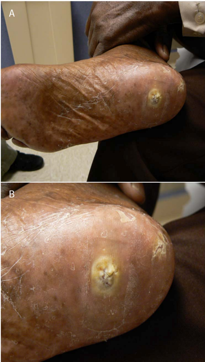
Figures 2A and 2B Clinical appearance of Intraepidermal eccrine adenocarcinoma exhibiting a hypertrophic lesion at the plantar right heel with deep fissuring and minimal granular tissue seen between fissures. Surrounding skin is macerated with yellowish hue secondary to dressing. (A) A close up view of the lesion is shown. (B)

The biopsy revealed intraepidermal eccrine adenocarcinoma (Fig 3A – D). The dermatology dept at LSVAMC was consulted. Due to the unusual nature of the lesion, the patient was presented at the local University Hospital Multidisciplinary Conference.