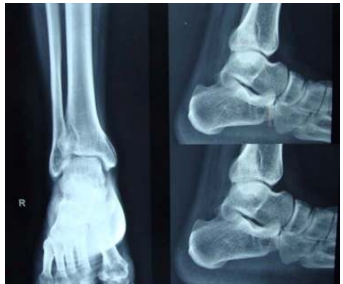
Figure 3 An anteroposterior and lateral digital radiographic views of the right ankle.

The osteotomy site was fixed using a semitubular plate and distal syndesmotic screw was used to fix the syndesmosis. Histological examination showed typical appearance of a benign osteochondroma with no evidence of malignant transformation. The patient had an uneventful recovery with no evidence of recurrence two years after surgery. The ankle range of motion was normal when patient was last evaluated.