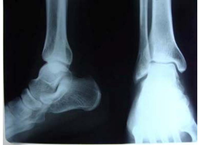
Figure 2 Plain radiograph showing an anteroposterior and lateral view of the right ankle.

The pain progressed to a more continuous intensity and even persisting during night and rest. In comparison to the contralateral limb, the affected side seemed to be slightly more swollen. (Fig. 1) There was tenderness at the distal interosseous space. Temperature was normal. All the hematological investigations were normal. A plain and digital radiograph was ordered which showed a bony swelling arising from distal fibula and expanding into the interosseous space and communicating with the lateral aspect of tibia. (Figs. 2 and 3) A computed tomography (CT) scan was done which confirmed the diagnosis and also revealed that the tumor is producing pressure effects on tibia. (Fig. 4) By using a transfibular approach, the tumor mass was excised (Fig. 5) and sent to histopathology. The scalloping of lateral aspect of tibia was confirmed.