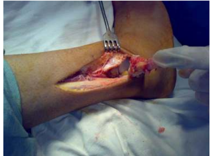
Figure 5 Intra operative photograph after fibular osteotomy showing tumor and pressure effects on tibia.

Osteochondromas are common benign bone tumors and most often occur in the metaphyseal area of distal femur, proximal tibia, and proximal humerus. 6 Distal radius, distal tibia, proximal and distal fibula and sometimes flat bones like ilium and scapulae are other areas where osteochondromas can occur. There have been many theories proposed to explain the occurrence of osteochondromas. Virchow's physal theory 7 , Keith's defect in perichondrial ring 8 , Muller's theory of presence of small nests of cartilage 9 are a few to mention. Current thought is that osteochondroma results because of misdirected growth of a portion of the physal plate. Osteochondroma may be sessile or pedunculated. The tumor often resembles a cauliflower and is covered by a cartilaginous cap usually 1 to 3mm thick. The cartilaginous cap is composed of bland hyaline cartilage with no cellular atypia. Malignant degeneration should be considered if there is an increase in the thickness of cartilage which becomes evident in an adult.