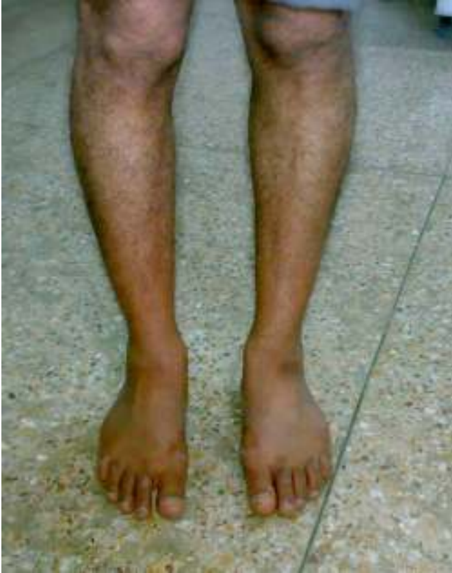
Figure 1 Clinical photograph with hard to appreciate swelling on right side.

The pain progressed to a more continuous intensity and even persisting during night and rest. In comparison to the contralateral limb, the affected side seemed to be slightly more swollen. (Fig. 1) There was tenderness at the distal interosseous space. Temperature was normal. All the hematological investigations were normal. A plain and digital radiograph was ordered which showed a bony swelling arising from distal fibula and expanding into the interosseous space and communicating with the lateral aspect of tibia. (Figs. 2 and 3) A computed tomography (CT) scan was done which confirmed the diagnosis and also revealed that the tumor is producing pressure effects on tibia. (Fig. 4) By using a transfibular approach, the tumor mass was excised (Fig. 5) and sent to histopathology. The scalloping of lateral aspect of tibia was confirmed.