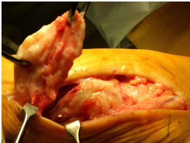
Figure 4 Intra-operative photograph showing dissected superficial swelling from the lateral malleolus.