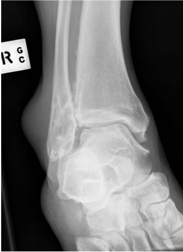
Figure 3a Ankle mortise view showing soft tissue swelling lateral to lateral malleolus. A multiloculated osteolytic lesion is seen in the distal fibula.

The differential diagnosis includes giant cell tumor, gouty arthropathy, ganglion cyst, aneurysmal bone cyst or synovial sarcoma.