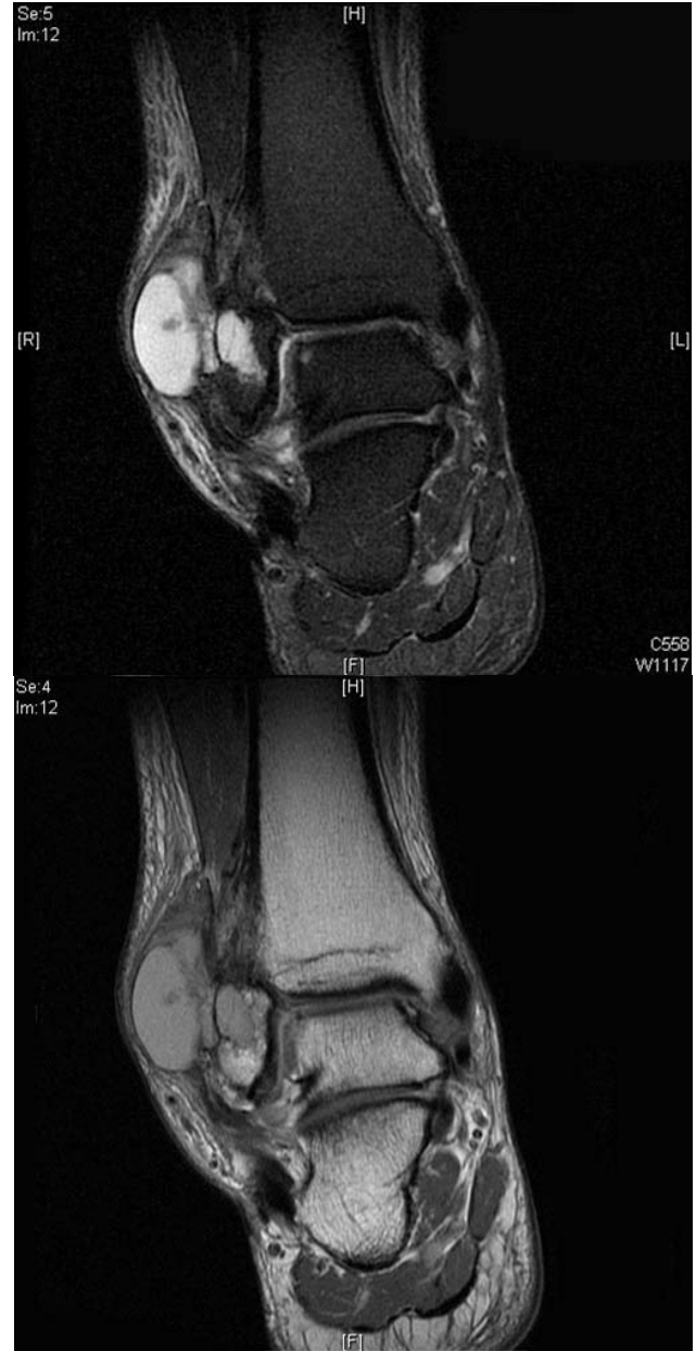
Figure 2 Coronal T2 and T1 weighted MR image showing a well defined homogeneous bright signal in T2 and decrease signal in T1, extending into the Anterolateral soft tissues.

Plain radiograph revealed moderate osteoarthritis of the ankle with joint space narrowing. There was a subtle multiloculated osteolytic lesion in the lateral malleolus with thin sclerotic margins along the intramedullary portion of the lateral malleolus. The distal fibula had mild remodeled expansion with thin cortical bone. There was a huge soft tissue swelling related to the lateral malleolus. (Fig. 3ab)