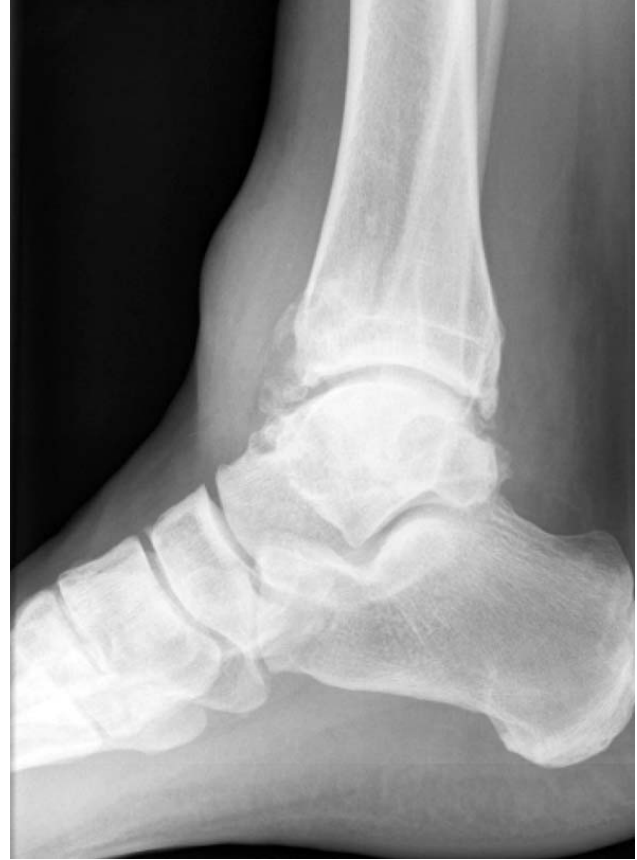
Figure 3b Lateral radiograph showing diffuse osteoarthritis of the anterior and posterior ankle mortise. Soft tissue swelling is also appreciated anteriorly.

Under tourniquet control the ganglion was excised through a lateral incision. There was a 4 cm x 4 cm soft cystic mass which communicated directly with the lateral malleolus. There was a small defect over the posterior aspect of the malleolus. (Fig. 4)