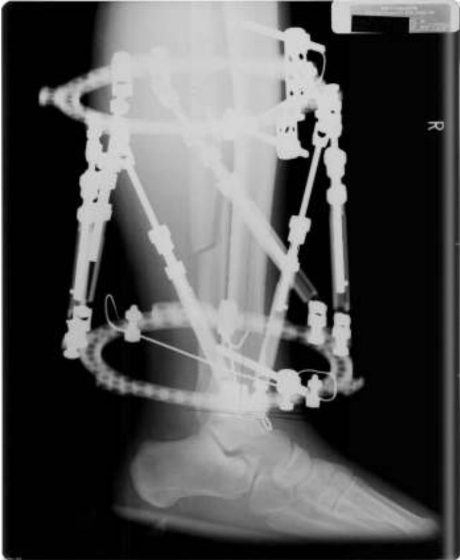
Figure 4 Immediate lateral post-operative radiograph showing fibular osteotomy.

A case study was reported by Mabit, et al., where a TSF was placed on a young girl with ankle varus that resulted from a malunited ankle fracture. 5 The authors chose to correct her deformity gradually with a TSF preassembled and with the tibial rings oriented 30 degrees in the coronal plane matching the deformity. A tibial osteotomy was performed and distraction took place on the fourth post-operative day. The patient stayed in the TSF for 2.5 months. The patient went on to successful healing.