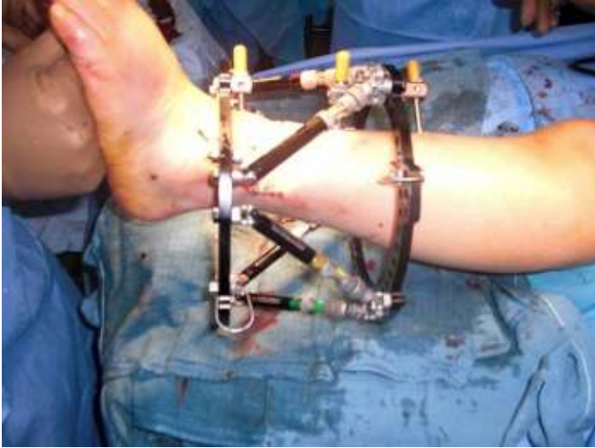
Figure 2 Intra-operative image showing application of the Taylor Spatial Frame (TSF).

If the CORA is located within a joint, generally the osteotomy is made proximal to the CORA within bone with good blood supply. A lateral incision was then made over the fibula with dissection taken down to the shaft. Utilizing a sagittal saw a transverse osteotomy was made. The final frame construction was made sure to be orthogonal to the tibia. (Fig. 2) Post-operatives radiographs were taken to ensure proper alignment of the frame. (Figs. 3 and 4) Adjustments were started approximately 10 days after surgery. Radiographs were taken on a weekly basis. The only complication that occurred was a pin tract infection which resolved with antibiotics. The frame was removed in 3 months when bony consolidation of the osteotomy was identified on radiographs. (Figs. 5 and 6)