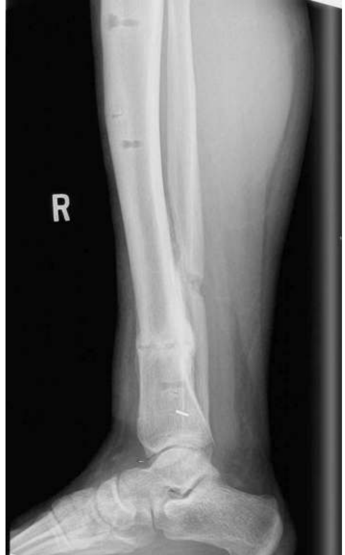
Figure 5 Final lateral post-operative radiograph showing healed osteotomy sites and decrease tibial procurvatum.

Feldman, et al., describe using the TSF for tibial malunions and nonunions. They had 18 patients in their study that had a TSF applied. The average time in the frame was 18.5 weeks. All patients went on to successful healing except one who developed a varus deformity through the healing fracture in the tibia.