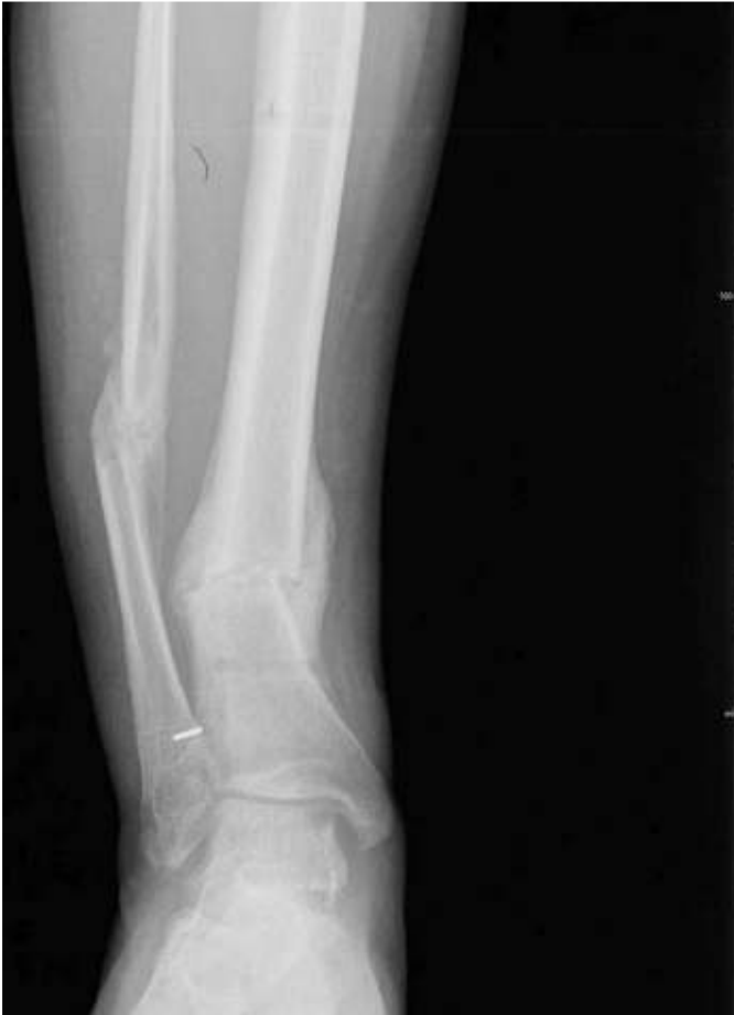
Figure 6 Final AP post-operative radiograph showing healed osteotomy sites with decrease in valgus position of the ankle.