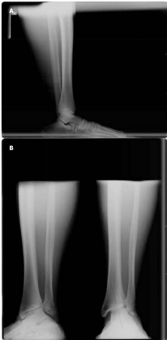
Figures 1A and 1B Lateral pre-operative radiograph displaying tibial procurvatum and relatively narrow joint space. (A) The anterior posterior (AP) and mortise pre-operative radiographs demonstrating significant valgus of the mortise and increased medial clear space. Also note decreased tibia-fibula overlap. (B)