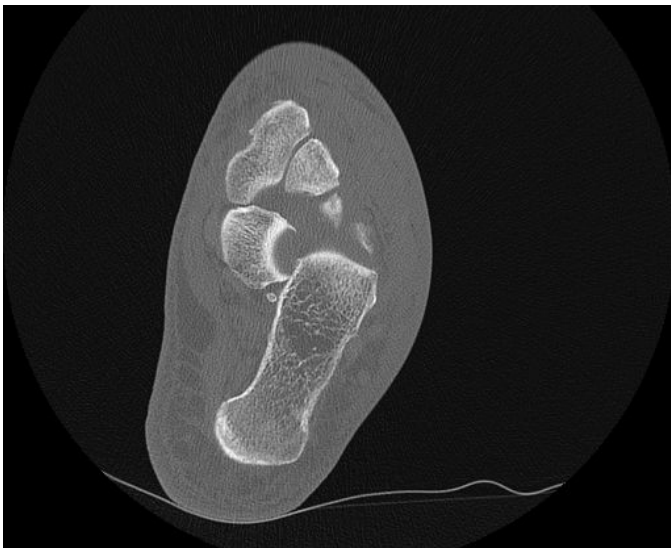
Figure 2 Dislocated navicular resting inferior to the sustentaculum tali.