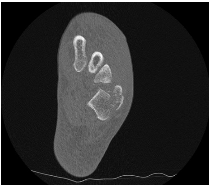
Figure 3 Cuboid fracture.