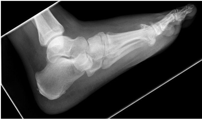
Figure 1 Dislocated navicular resting inferior to the sustentaculum tali.